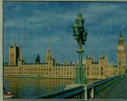
.LONDON GOES LIVE

Tuesday marked the beginning of a three-month period during which Londoners and London businesses will be given priority in ap-